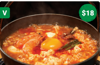
25. SPICY SEAFOOD SOFT TOFU SOUP WITH RICE 해물순두부탕 / 辣海鮮豆腐湯