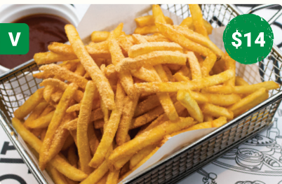
20. CHEESE FRENCH FRIES 치즈감자튀김 / 芝士薯條