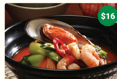
51. SPICY SEAFOOD NOODLE SOUP 해물짬뽕면 / 辣海鮮湯麵