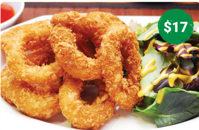
22. PANKO CALAMARI RINGS 칼라마리링 / 特製炸魷魚圈