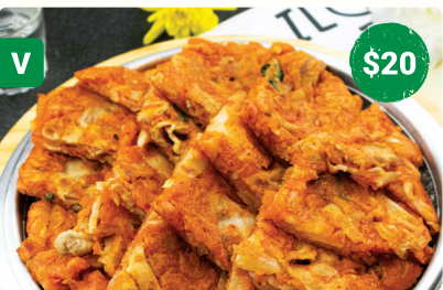
30. KIMCHI PANCAKE 김치전 / 泡菜餅