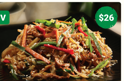
31. JAP CHAE - SOY POTATO NOODLES 잡채 / 炒粉絲