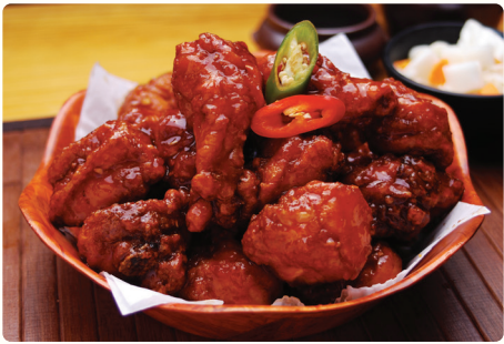
2. SPICY FRIED CHICKEN 양념치킨 / 蜜汁辣炸雞