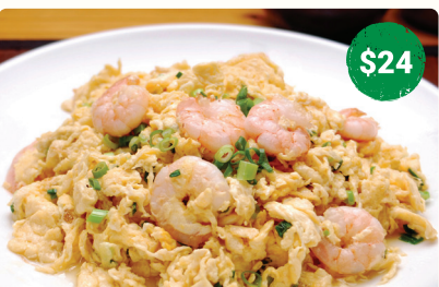
33. PRAWN STIR FRIED EGGS 새우계란볶음 / 蝦仁炒雞蛋