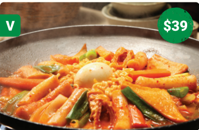
12. CHILLI RICE CAKE & FISHCAKE WITH RAMEN 라볶이전골 / 辣年糕鍋