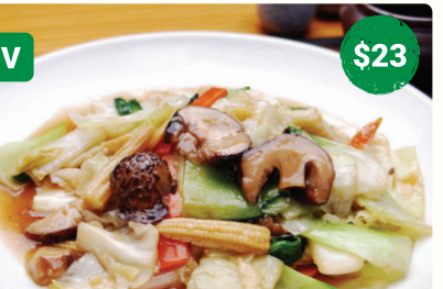
37. SEASONAL VEGETABLES & MUSHROOMS 야채버섯볶음 / 炒時蔬