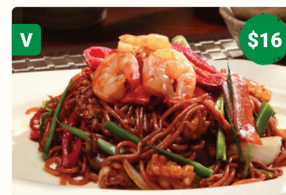
53. STIR FRIED SOY SEAFOOD NOODLES 해물볶음면 / 海鮮炒麵