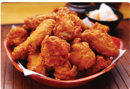
1. OLD SCHOOL FRIED CHICKEN 후라이드치킨 / 原味轟炸雞