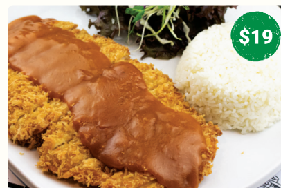
43. PORK KATSU WITH RICE 수제돈까스정식 / 手工炸豬排飯