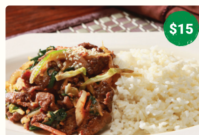
40. SOY BULGOGI BEEF WITH RICE 불고기덮밥 / 牛肉蓋飯