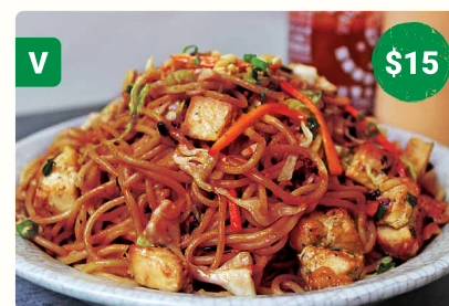
52. STIR FRIED SOY CHICKEN NOODLES 치킨볶음면 / 雞炒麵