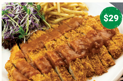
32. PORK KATSU & FRIES PLATTER 돈까스와 감자튀김 / 炸豬排薯條