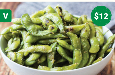
21. SPICY SOY EDAMAME 매콤간장 에다마메 / 辣醬毛豆