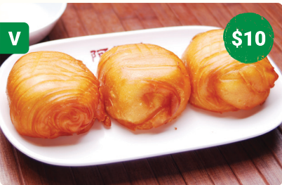
23. FRIED BUNS WITH CONDENSED MILK 연유꽃빵 / 煉乳黃金包