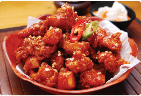
7. EXTRA SPICY BONELESS CHICKEN 순살닭강정 / 甜辣雞塊