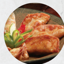
FRIED PORK DUMPLINGS 군만두 / 手工炸餃