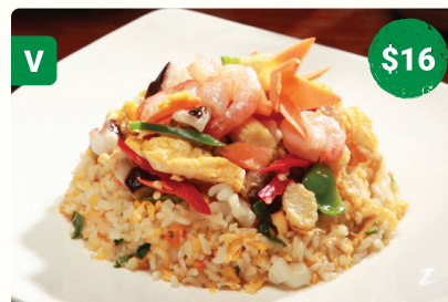
42. SEAFOOD FRIED RICE 해물볶음밥 / 海鮮炒飯