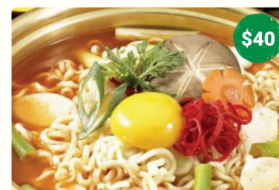
50. JUMBO MIXED SPICES RAMEN 점보섞어라면 / 巨無霸綜合拉麵