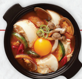
SPICY SEAFOOD SOFT TOFU SOUP 해물순두부탕 / 辣豆腐湯