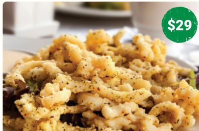
35. SALT & PEPPER SQUID 오징어튀김 / 酥炸魷魚花