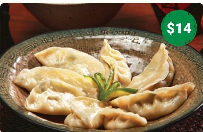
17. STEAMED PORK DUMPLINGS 찜만두 / 手工蒸餃