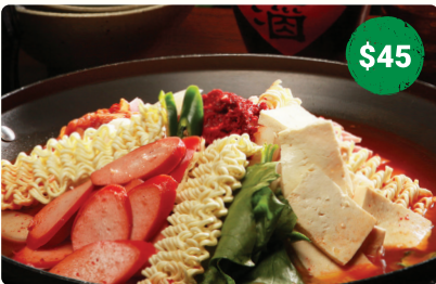
11. SPICY SAUSAGE & VEGETABLES WITH RAMEN 부대찌개전골 / 泡菜香腸辣味鍋