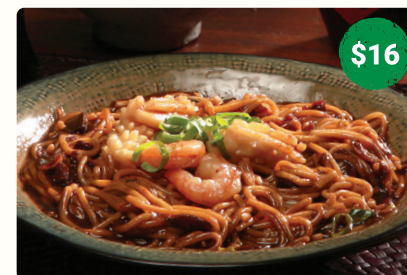
48. SEAFOOD BLACK BEAN NOODLE 해물짜장 / 海鮮炸醬麵