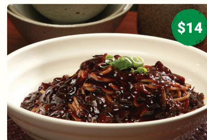
46. SIGNATURE BLACK BEAN NOODLE 짜장면 / 炸醬麵