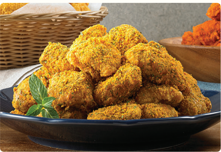
8. SNOW CHEESE BONELESS CHICKEN 치즈순살치킨 / 起司炸雞塊