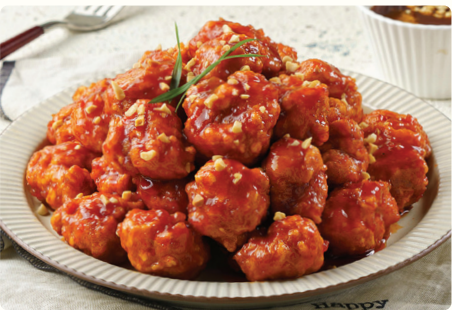
9. MILD GARLIC BONELESS CHICKEN 순살마늘치킨 / 蒜辣炸雞塊