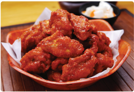
5. HONEY TABASCO CHICKEN 허니타바스코치킨 / 塔巴斯科炸雞