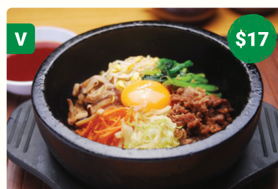
38. STONE POT BULGOGI BEEF BIBIMBAB 돌솥비빔밥 / 韓式石鍋拌飯