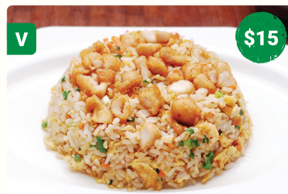
41. CHICKEN FRIED RICE 치킨볶음밥 / 雞炒飯