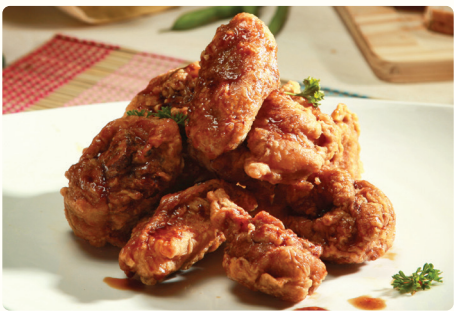
3. SOY FRIED CHICKEN 간장치킨 / 韓式招牌醬油雞