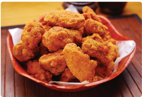
4. CHEESE SPRINKLE CHICKEN 치즈치킨 / 起司風味炸雞