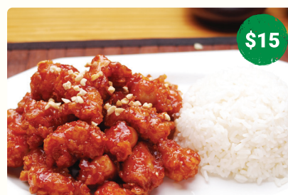
45. SPICY BONELESS CHICKEN RICE 닭강정밥 / 甜辣雞塊蓋飯