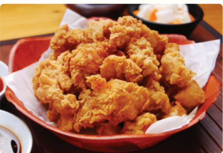
6. CRISPY BONELESS CHICKEN 크리스피순살치킨 / 酥炸雞塊加蘸醬