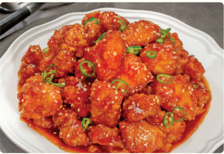
10. TABASCO BONELESS CHICKEN 순살타바스코치킨 / 塔巴斯科雞塊