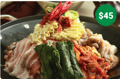
13. SPICY PORK BELLY & KIMCHI WITH RAMEN 돼지김치전골 / 辣豬肉泡菜鍋