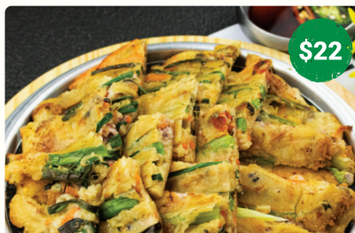
29. SEAFOOD PANCAKE 해물파전 / 海鮮餅