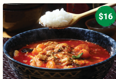
39. SPICY SEAFOOD SOUP WITH RICE 해물짬뽕밥 / 辣海鮮湯飯