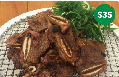
27. GRILLED L.A. SHORT RIBS 직화 LA갈비 / 洛杉磯牛排骨