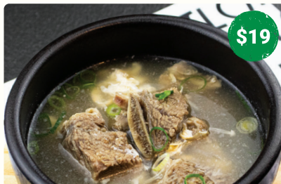
24. BEEF SHORT RIB SOUP WITH RICE 갈비탕 / 牛大排湯