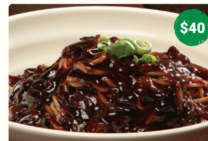
47. SIGNATURE JUMBO BLACK BEAN NOODLE 점보짜장 / 巨無霸炸醬麵