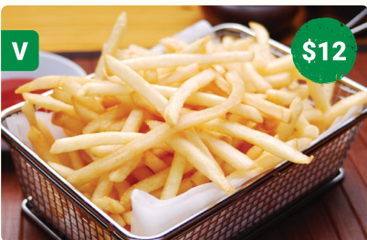
19. FRENCH FRIES 감자튀김 / 炸薯條