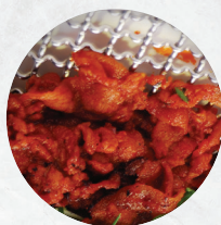
SPICY PORK BELLY 매운삼겹살 / 辣烤五花肉