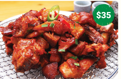
28. GRILLED SPICY PORK KNUCKLE 직화 매운족발 / 辣烤豬蹄