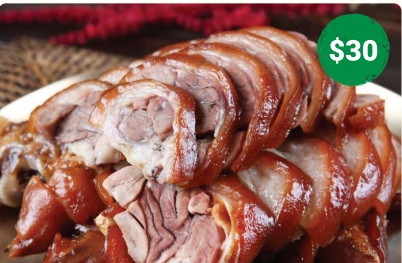
36. FIVE SPICE PORK KNUCKLE - COLD DISH 오향족발 / 五香肘花