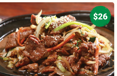
34. KOREAN SOY BULGOGI BEEF 철판소고기 / 韓式烤牛肉