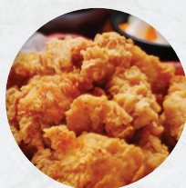
CRISPY BONELESS CHICKEN 크리스피순살치킨 / 酥炸雞塊加蘸醬

CHOOSE ONE SIDE DISH FROM BELOW + STEAMED RICE