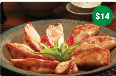
16. FRIED PORK DUMPLINGS 군만두 / 手工炸餃