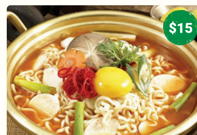
49. MIXED SPICES RAMEN 섞어라면 / 綜合拉麵