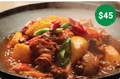
15. SPICY CHICKEN & POTATO WITH RAMEN 닭도리탕 / 香辣嫩雞鍋