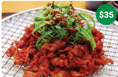
26. GRILLED SPICY PORK BELLY 직화 매운삼겹살 / 辣烤五花肉