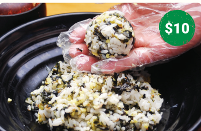
18. DIY SEASONED RICEBALLS 주먹밥 / 手工抓飯