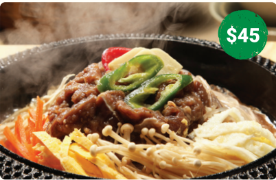
14. BEEF & MUSHROOMS WITH POTATO NOODLE 불고기전골 / 牛肉菌菇鍋