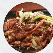
SOY BULGOGI BEEF 소불고기 / 醬板牛肉