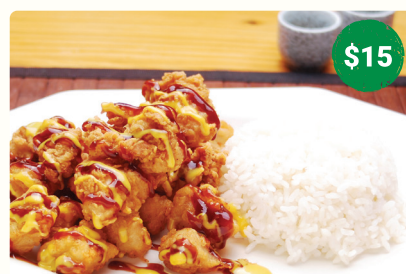
44. CRISPY BONELESS CHICKEN RICE 순살치킨밥 / 炸雞塊蓋飯